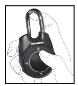
5. Enter your new combination.